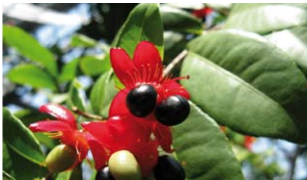
Mickey Mouse Plant, Ochna Serrulata