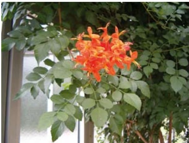
Cape Honeysuckle, Tecoma capensis