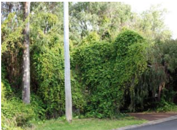
Margaret River townscape streetscape - weeds include Spotted Gum, Ironbark, Victorian Tea Tree, Dolichos Pea, Morning Glory, Ivy.