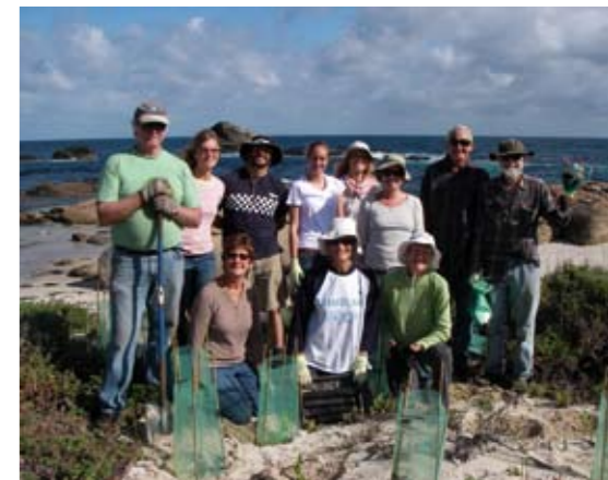
Capes Volunteer Team working on the coast in 2011

In 2010/11 the CCG completed a number of private contracts, generating a modest income for the group. As environment and natural resource management specialists, the CCG offers professional services and advice in the areas of biodiversity and waterway planning and management with a focus on the local species and conditions of the Cape to Cape region. Income received from fee for service work is contributed back into the group to fund community projects.