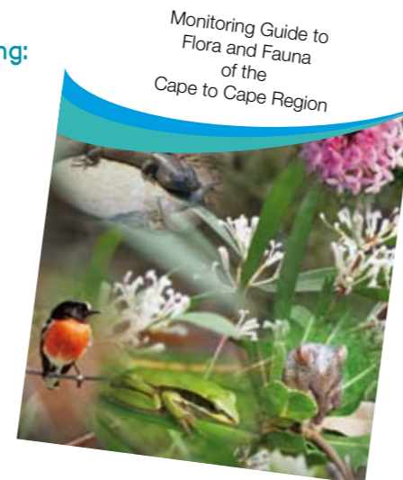
CCG Guide to Flora and Fauna of the Cape to Cape Region